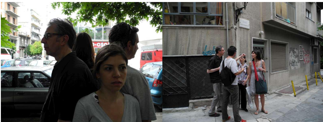
[ Urban Oracle ] speaking words in a tender gesture to the city of Athens.