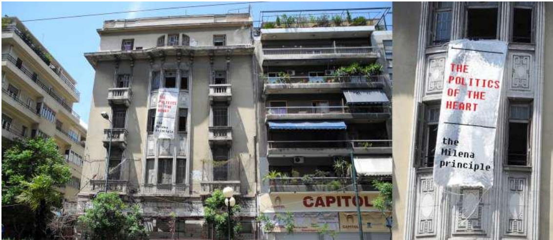
[ Politics of the heart ] banner in situ

Interventions of the Milena principle with students