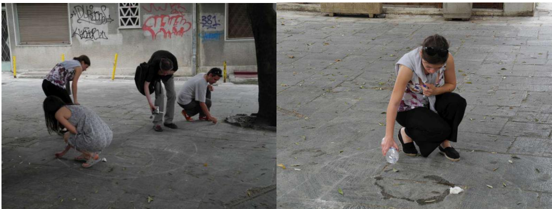
[ Whirling thoughts ] drawings with chalk of buildings and water